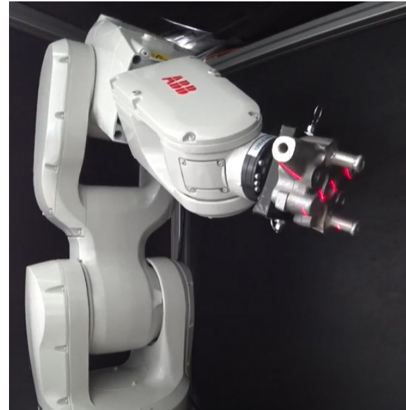
Original Nissan part attached to the end of a robot arm and 3D scanned.

There are many industries facing supply challenges and risks, including automotive, rail, oil and gas, mining, and defence. Downtime due to supply issues can result in significant financial or operational losses. Metal parts commonly become obsolete and impossible to source. This project has demonstrated these issues can be solved successfully using SPEE3D's proprietary 3D scanning and metal 3D printing technology.