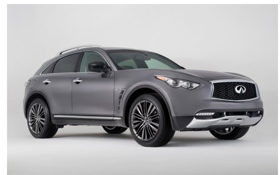
Customer vehicle: Nissan QX70 Infiniti